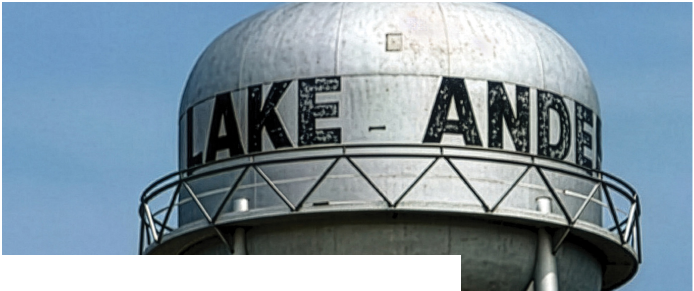
Water Tower in Lake Andes, South Dakota, where the South Dakota interviews were held.