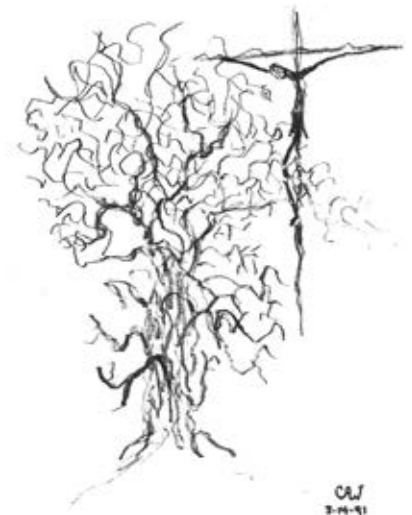
My last sketch for KJ