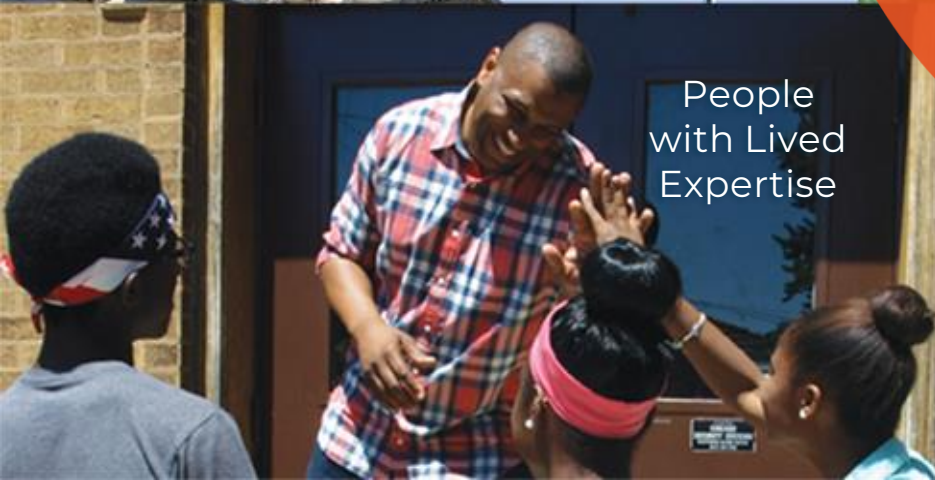
People with Lived Expertise