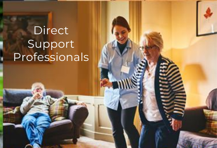
Direct Support Professionals