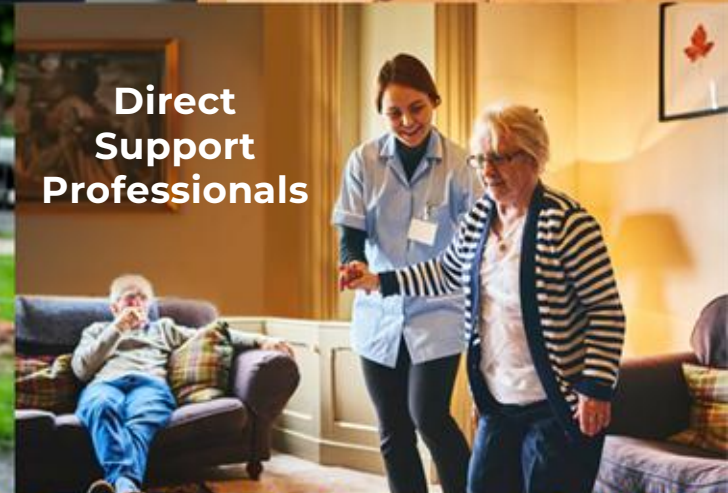
Direct Support Professionals