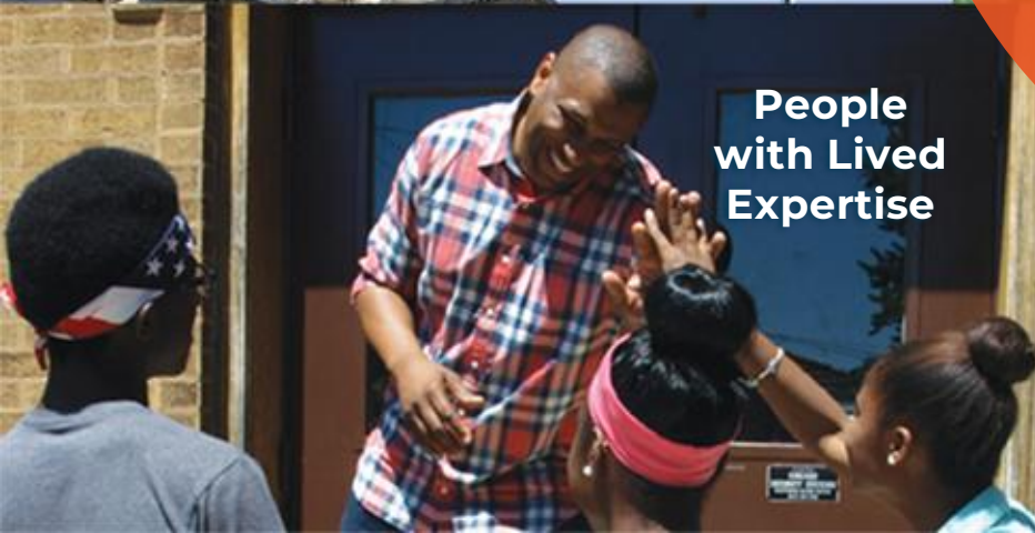
People with Lived Expertise